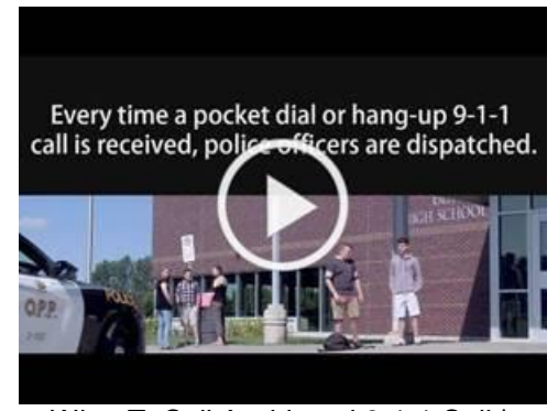
#KnowWhenToCall Accidental 9-1-1 Call | opp.ca